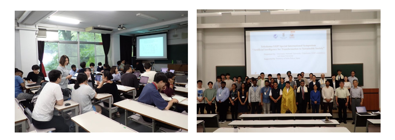
The second themed lecture