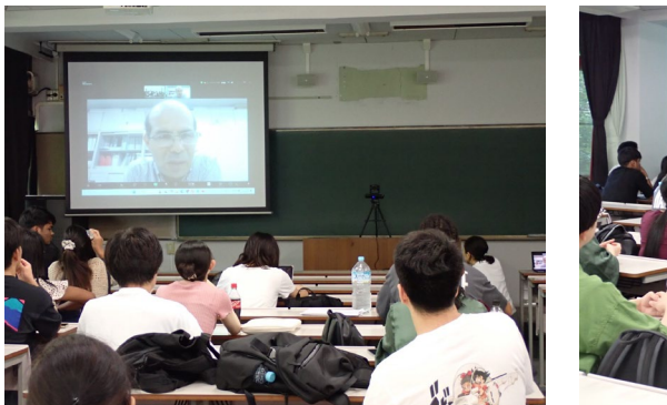
The third themed lecture