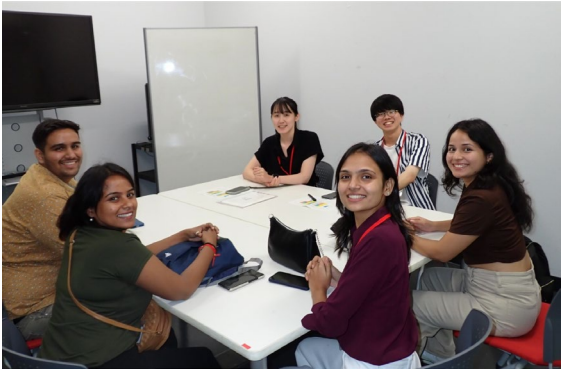
The first themed lecture